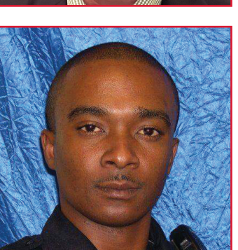
2021 College of Humanities and Social Sciences Distinguished Alumnus of the Year

'01 Bachelor of Science in Environmental Geography '08 Master of Public Administration